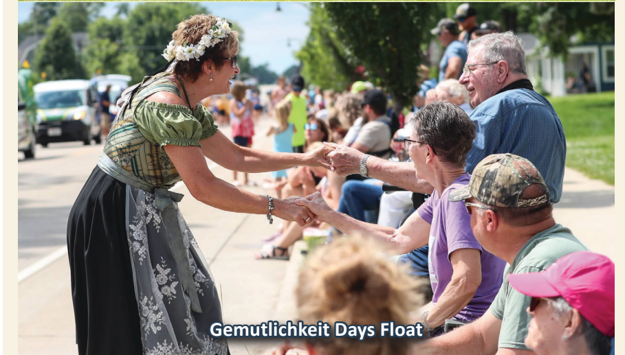
Gemütlichkeit Days Float

Sign-up to Receive Texts from Legendary Lake Mills