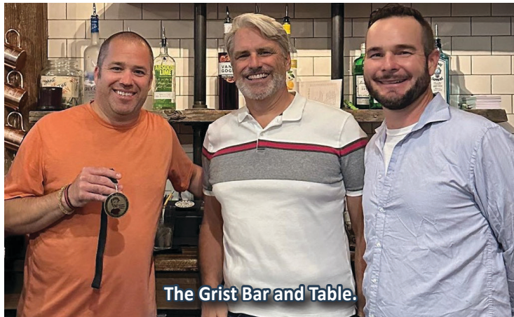
The Grist Bar and Table.