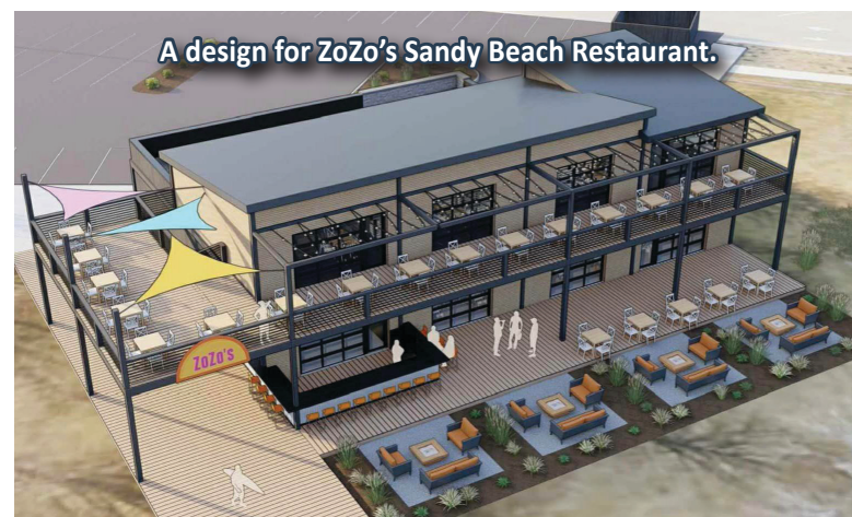
A design for ZoZo's Sandy Beach Restaurant.