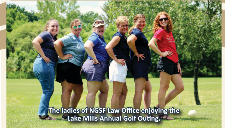
The ladies of NGSF Law Office enjoying the Lake Mills Annual Golf Outing.